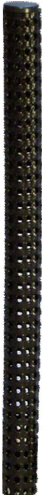
Actual Size 5/8" D x 9" L Porous Sidewalls